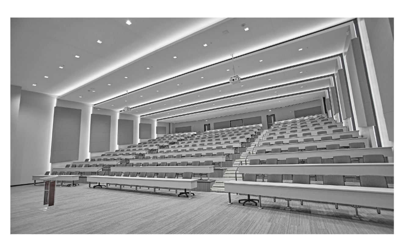
Our 242 seat auditorium is used for residency, hospital, and regional conferences and symposiums.

Ample study space is available to residents in the GME Center including the library pictured above and individual study rooms.