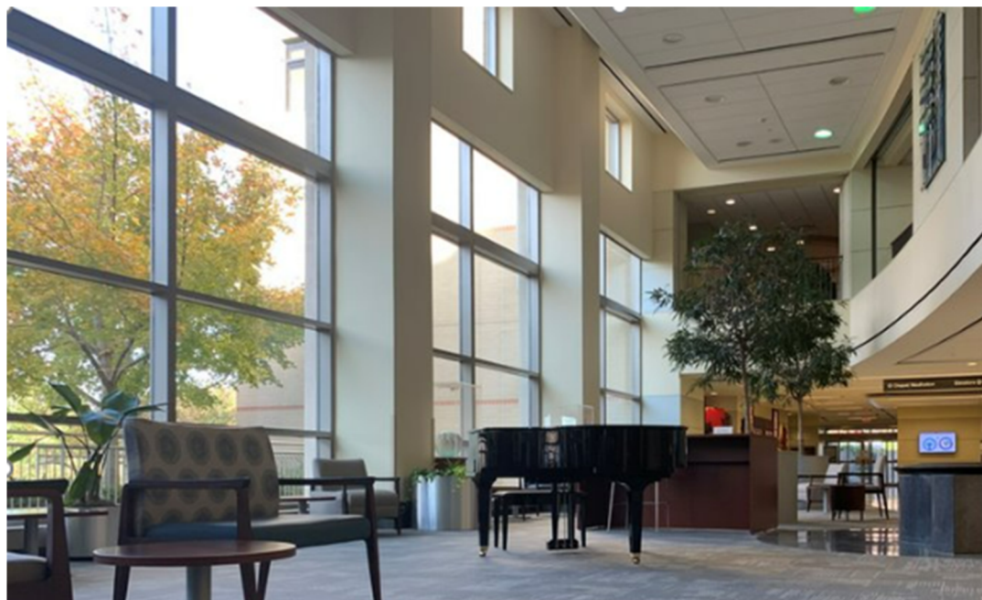
Main Lobby of the medical center.

Outpatient pharmacy, available to all staff, patients, and visitors.