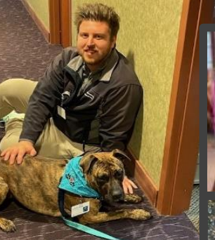
Pet therapy benefits the patient & staff.