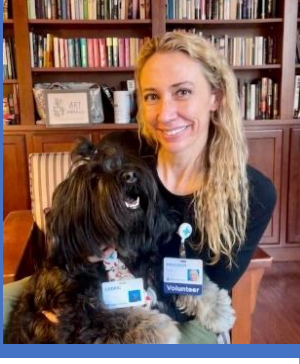
Meet Cedric the newest addition to the volunteer pet therapy teams!